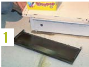
Remove base fronts

Suggested crew: Two (2) people per 16' of shelving