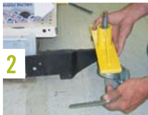
Attach bracket clip